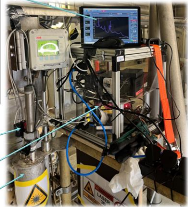
On-line PAT implementation at plant and extracted trends

Continuously recorded data exemplarily shown for a 24h-time-window during the online implementation of the Raman sensor in the chemical recovery plant at Gratkorn, Austria.