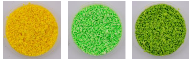
Figure 1: The functionality and robustness of the control system were tested in injection molding trials using multiple material streams.

The control system is based on a mathematical model that calculates the optimum portion of masterbatch according to the color deviations of the component. This represents the minimum required amount of additive needed to achieve the specified reference color. The process works as follows: First, the color of the current component is measured at a predefined position, using the inline color sensor. This color is then compared with a previously defined reference color. The resulting color difference ( \Delta E -value) serves as the input to the model, which determines the required amount of color masterbatch and sends this information to the dosing unit.