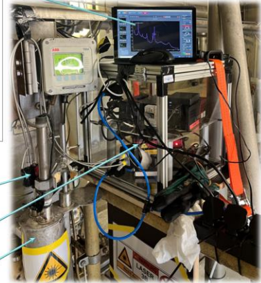
On-line PAT implementation at plant and extracted trends